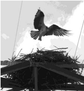
Photo of an eagle which I took at Clark Hill Lake landing in its nest which was on top of a steel tower in the middle of the lake. Image on the left is actual photo and a negative image of the same on the right.