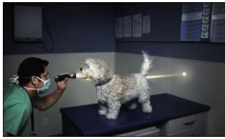
No matter how treacherous your journey may seem, there is light at the end of the tunnel.