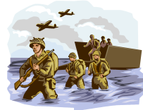
Armed Forces Day May 19, 2012