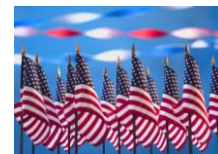
Memorial Day (Observed) May 28, 2012

3. QUOTE ME: 1. There are a lot more marital arguments over a wink than a mink. 2. The only way to see a rainbow is to look through the rain. 3. If everything is coming your way, you are in the wrong lane! 4. When attempting to open a locked door with only one free hand, the key will be in the opposite pocket. 5. A sharp tongue and a dull mind are usually found in the same head. 6. Friends are those rare individuals who ask how we are and then actually listen to the answer.