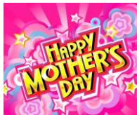
Mother's Day May 13, 2012